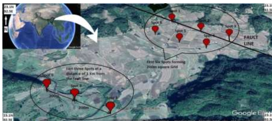
Figure 1: Map of the study area and formation of grid at Mat fault [2].

An indigenously developed and calibrated scintillation counter (Model: SMARTRnDuo , BARC, Mumbai, India) was deployed for measuring the radon data and meteorological data. From the analysis, it was observed that the two meteorological factors have a significant influence on the exhalation process of ^{222}\text{Rn} and ^{220}\text{Rn} gases and their diurnal and day-to-day effect on the two gases were also discussed in detail. According to BIS [10], Northeast India belongs to the highest seismic level (Zone V) and is one of the most seismically active regions of the world. Hence generating data and developing literature to describe the geophysical nature of the region is of vital importance as a natural disaster like an earthquake can harm human being in many ways. The authors hope the present study will serve as baseline data for such studies in the region.