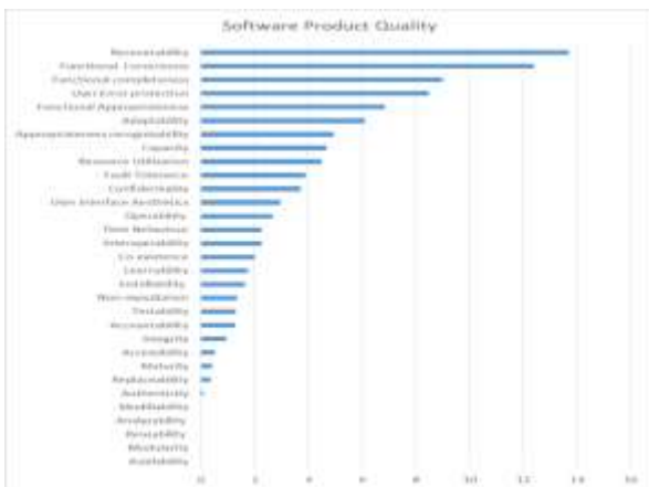
Fig. 3. Previous Study outputs

In previous study, the essential features of mobile application are functionality, suitability and usability. Portability and maintainability are least important as depicted in fig. 3.