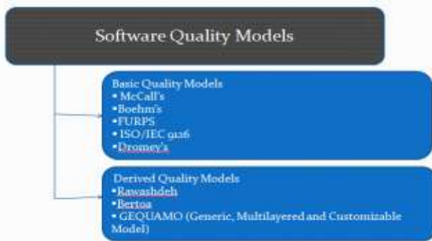
Fig. 1. Classification of Software Quality Models

Fig.1. depicts the classifications of software quality models. The McCall's, Boehm's, FURPS, ISO/IEC 9126 and Dromey's models are considered as basic quality models, while Rawashdeh, Bertoa, and GEQUAMO are considered as non-basic or derived models. For the development of the new quality model, all the above models whether it was basic or derived has been studied and analyzed. The aim of the proposed model is to overcome the limitations of the existing model. From basic and derived models, high-level quality characteristics with sub-characteristics are extracted in order to merge the advantages of both types. In the proposed model, all the classes of shareholders associated with a suitable range of quality characteristics are included. Consequently, the new model acts as a tool in the future for the evaluation and selection of appropriate COTS products.